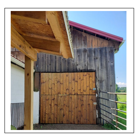
THANK YOU TO THE EMPLOYEES OF PORTAGE!

"Whatever you do, work at it with all your heart, as working for the Lord, not for human masters," -Colossians 3:23