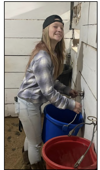
Portage Community employees